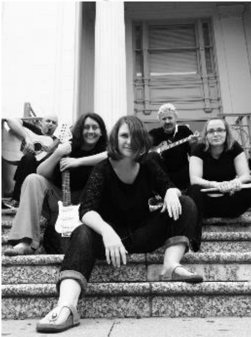
Kickin' it with the Science Dept.