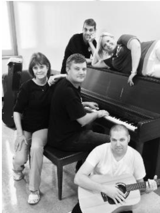
Singin' with Social Studies